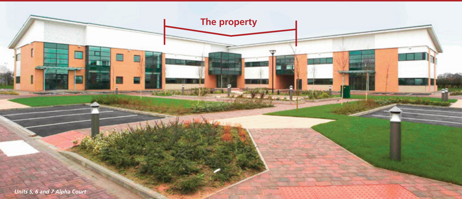
Units 5, 6 and 7 Alpha Court